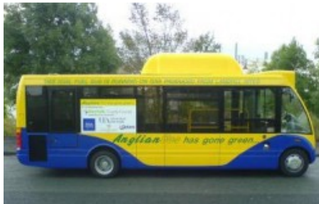
Dual-fuel diesel-biomethane powered bus in UK. ( www.uea.ac.uk ).

Funding for the project came partly from the EU-sponsored Civitas programme promoting cleaner and better transport in Europe's cities. Biomethane reduces greenhouse gas emissions and also particulate and NO x emissions to around half when using methane from landfill sites, food, and agricultural waste. Operating costs per mile basis are reduced as well. Source: University of East Anglia, Press release, 9 September 2009 ( www.uea.ac.uk ).